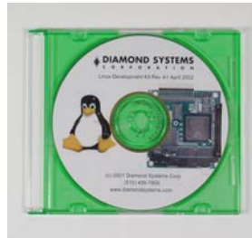
DK-LINUX-CD CD-ROM with Flash Linux distribution. Also ships with all kits below.