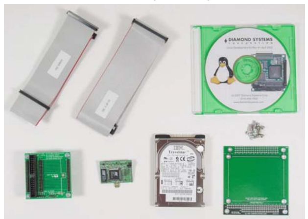
DK-LINUX-COM Combination kit, includes all items shown above.