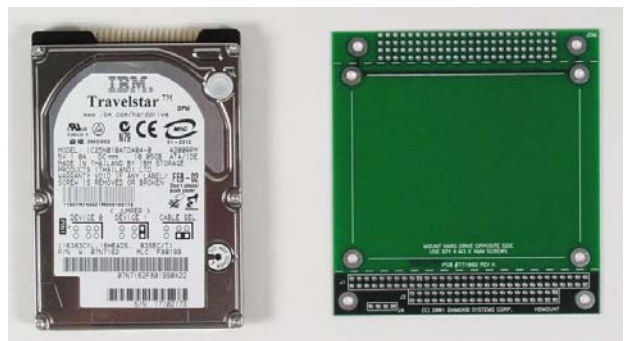
DK-LINUX-HD20 80GB hard drive (left) with full Linux pre-installed; includes hard drive mounting board (right) and cable.