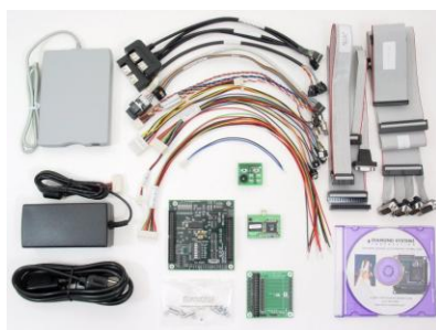
Hercules II Development Kit