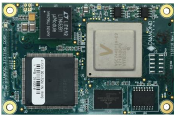
EPSM-10GX Switch Module

The EPS-24G2X Ethernet switch is designed around Diamond’s new EPSM-10GX Ethernet switch module. Like the popular Computer-on-Module technology, the EPSM-10GX encapsulates a complete Ethernet switch circuit into a compact module, simplifying the design of custom embedded and industrial Ethernet switch solutions. The EPS-24G2X adds the necessary power supplies and last inch of I/O circuitry needed to create an off-the-shelf complete solution in the industry-standard “3.5 inch” form factor. The switch provides layer 2+ performance (layer 3 capable with software upgrade) via its built-in 500MHz MIPS processor and comprehensive suite of software features. All features are manageable via any Ethernet port or an auxiliary “out of band” serial interface. The switch operates at non-blocking wire-speed performance, meaning all ports can operate at full speed simultaneously, resulting in a 44Gbps total throughput capability.